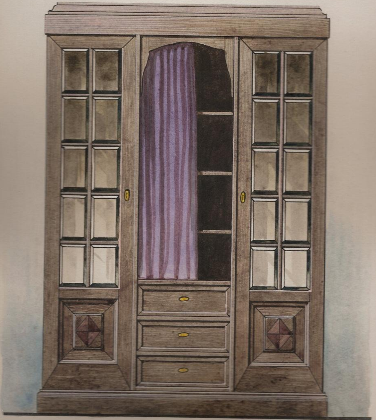
Bücherschrank N 1-10.