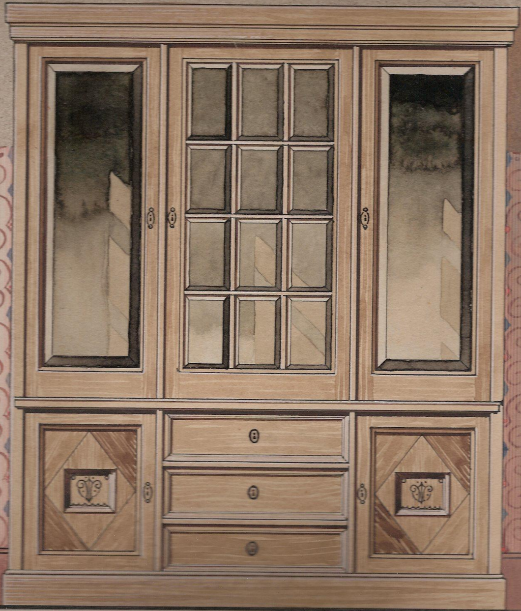
Entwurf eines Bücherschranks. Harry Weinhold.